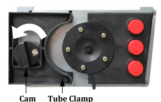
Step 3: Open the front door of the dispenser. Open the tube clamp by turning the cam counterclockwise.