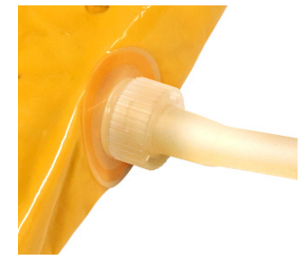
Step 2: The dispenser tube will pierce the inner seal of the bag when installed. Make sure the cap is securely threaded onto the bag fitting.

Step 1: Pull ring to remove fitting cover from a preheated product bag. Use a new dispenser tube (PN 5285) for each bag.